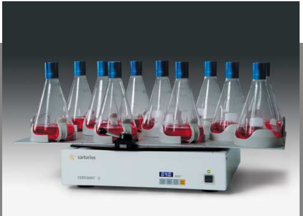
CERTOMAT ® U Benchtop shaker with magnetic drive