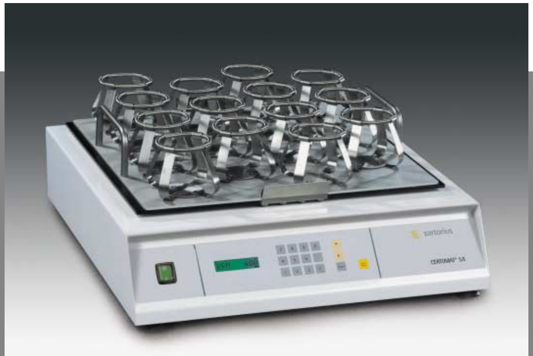
CERTOMAT ® S II Orbital benchtop shaker