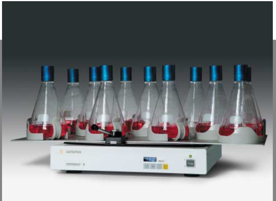
CERTOMAT ® R Benchtop shaker with magnetic drive